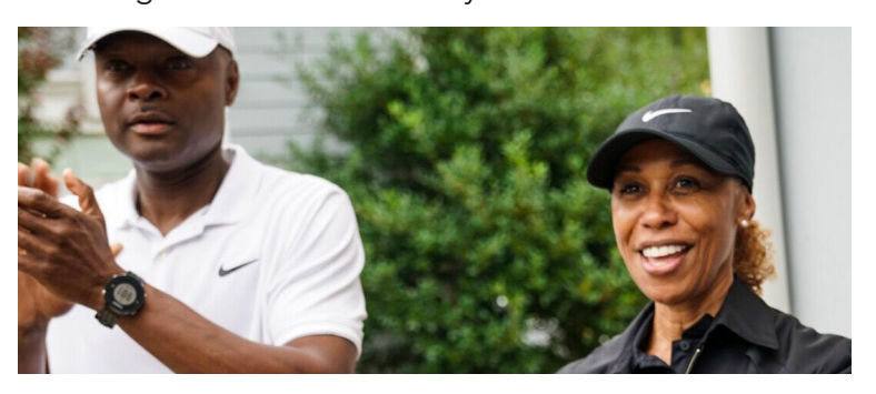
The International Coalition for Children with Incarcerated Parents